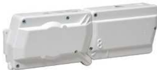
SSF-PROBE-DNRW (watertight version)